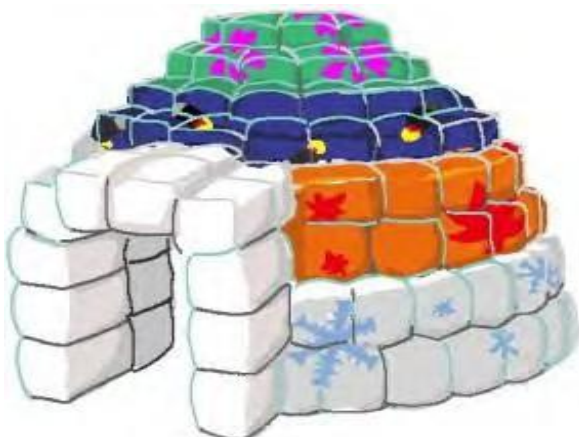
Title: Four seasons of Japan (Method : Painting)