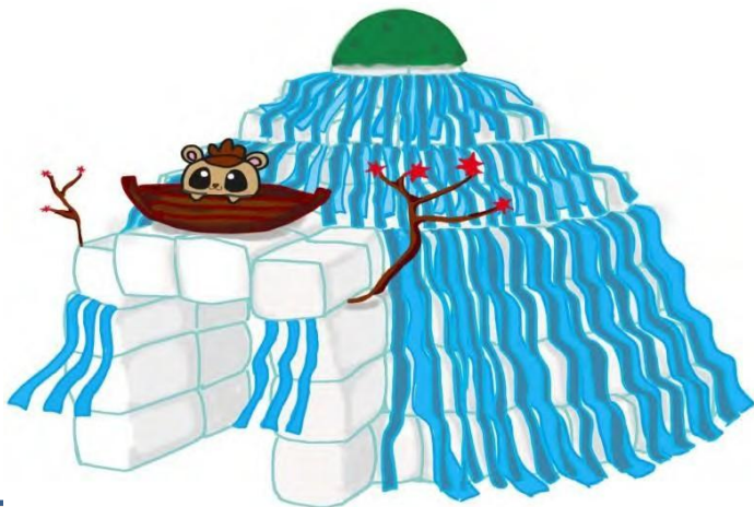
Title : Sandankyo falls in Akiota-town (Method :Painting & Decoration )