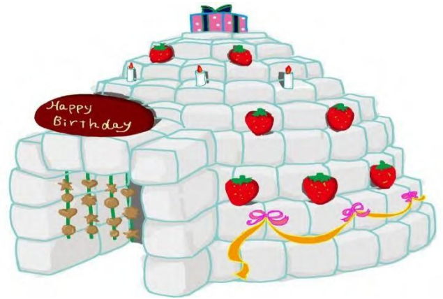
Title : Happy birthday (Method :Decoration )