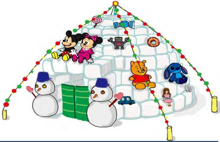
Title : The Igloo land like a Disney (Method :Decoration )