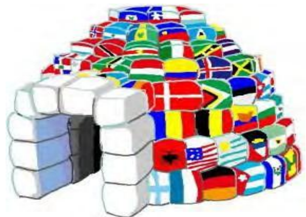
Title : We are the world (Method : Painting)