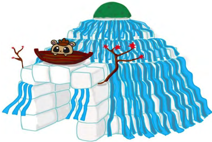
Title : Sandankyo falls in Akiota-town (Method :Painting & Decoration )