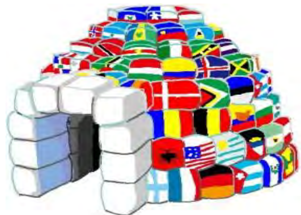
Title : We are the world (Method : Painting)