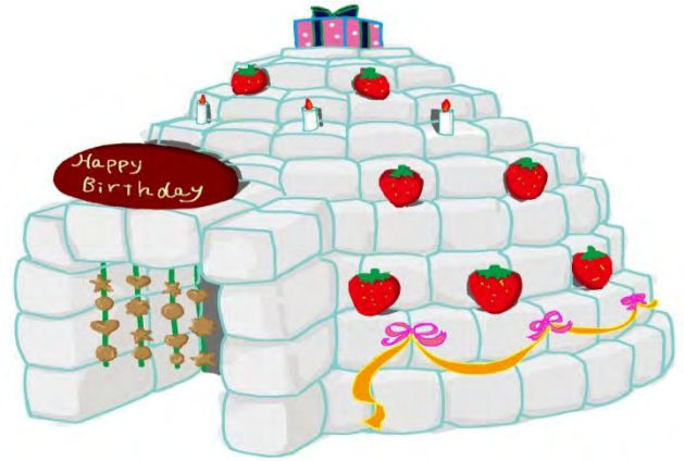
Title : Happy birthday (Method :Decoration )