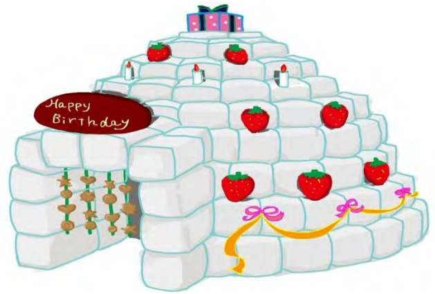
Title : Happy birthday (Method :Decoration )